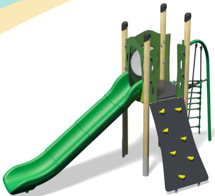
A toddler tower system comprising of: