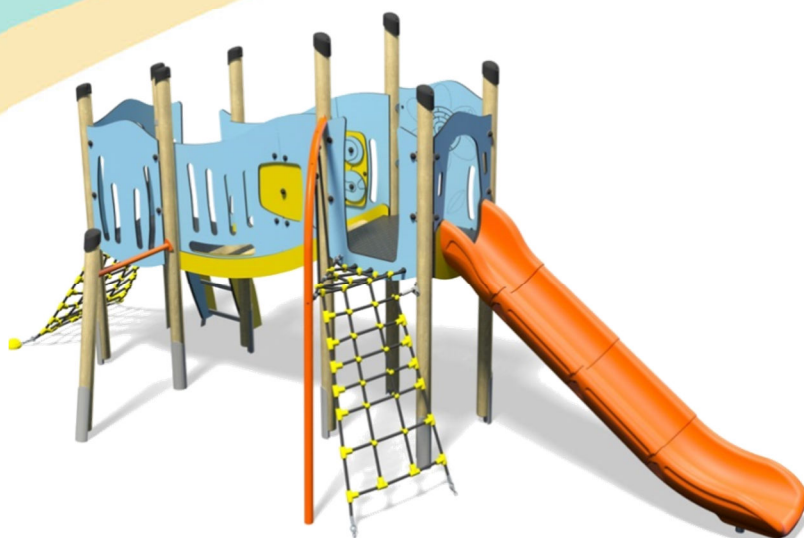
A toddler tower system comprising of: